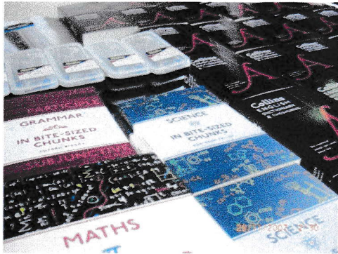
Books and school materials for ESK Quaker School, Cyanika

The 1994 genocide saw 800,000 people murdered in ten weeks. A generation on it is still affecting some of our sponsored children who suffer from depression, anxiety, and other trauma-related disorders. In recognising these mental health issues, we have selected local partners who can effectively intervene with psychological assessment and treatment.